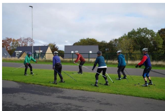
This could be you, in June!