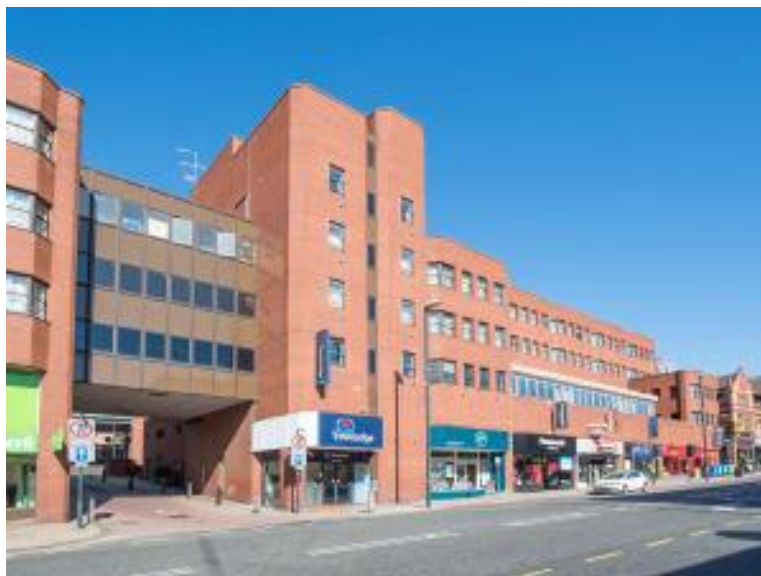
Travelodge Leeds Central Vicar Lane

We will be booking rooms at two Travelodge Hotels, both within 2.5 miles of the Centre: the Leeds Central Vicar Lane and the Leeds Central, and at the Premier Inn, Headingley, at 4 miles from the centre. Current prices suggest £50 per person/night bed and breakfast, based on two people sharing. Accommodation is not included in the cost of the event, but if you wish to use one of these two hotels, we will tell you the actual cost.